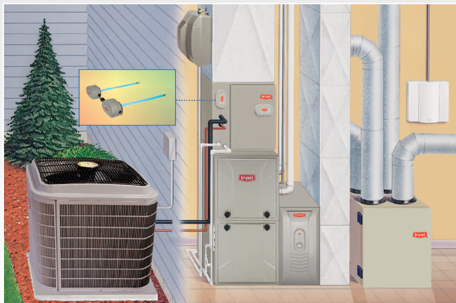
Air Conditioner and Gas Furnace System